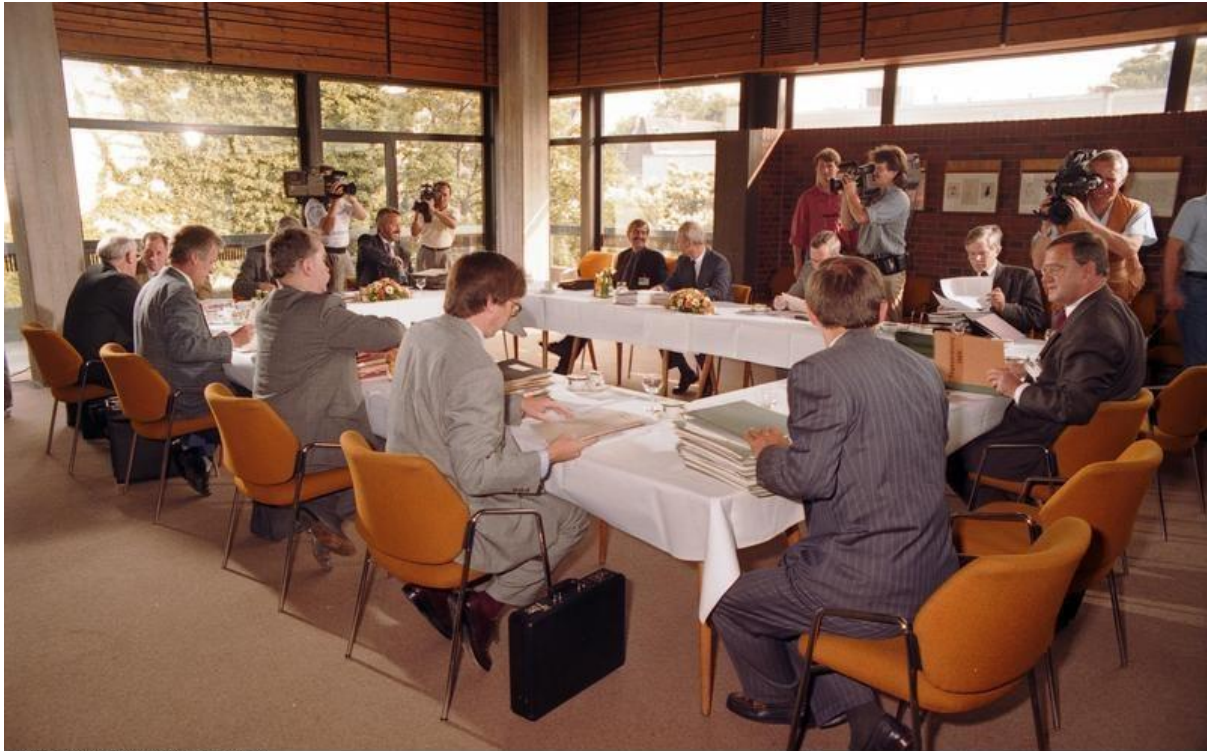
29. Juni 1990

Instrument to improve CO-OPERATION/DIALOGUE: establishing a "Social District Conference" with more than 40 organizations and institutions TASK: identify needs, organize and operate common activities and projects to improve the living situation and the intersocial and intercultural dialogue